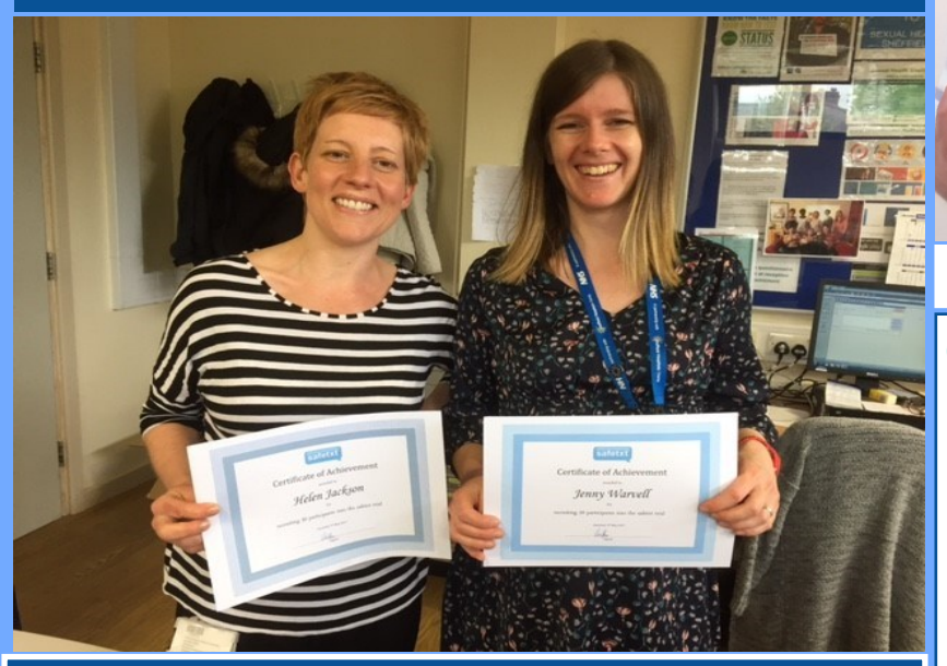
One year follow up

Please let us know if your team deserves a certificate!