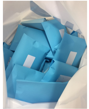
Sack of envelopes ready to be sent off