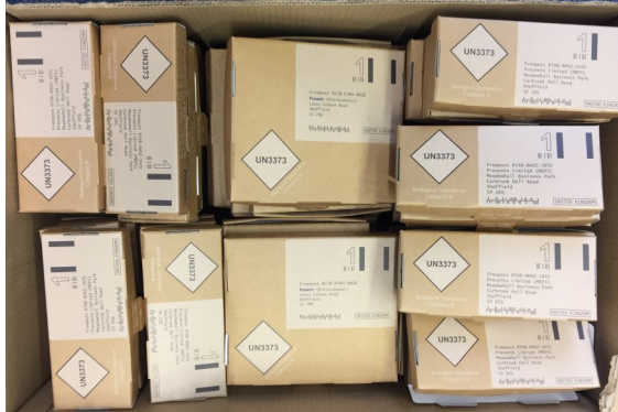
Test kits all boxed up ready to go into the envelopes