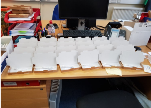
Lucy's desk when preparing the test kits for the participants

It is an incredible amount of work but all made possible by the fantastic recruitment levels at the clinics.